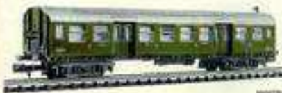
SCALEXTRIC 51 300 50