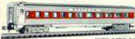
SCALEXTRIC 51 300 50 Serie FS

French coach with interior lighting Voiture française avec éclairage intérieur Carrozze francese con illuminazione interna Personenvogndr mit Innenbeleuchtung