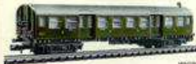
SCALEXTRIC 51 300 50

French coach Voiture française Carrozze francese Personenvogndr (= 120 mm =)