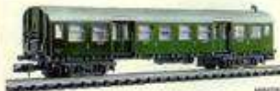
SCALEXTRIC 51 300 50

French coach Voiture française Carrozze francese Personenvogndr (= 120 mm =)