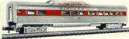
SCALEXTRIC 51 300 50 Serie FS

American 1950-59 car Voiture 1950-59 Carrozze 1950-59