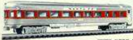
SCALEXTRIC 51 300 50 Serie FS

American streamlined car Voiture aérodynamique Carrozze aerodinamica