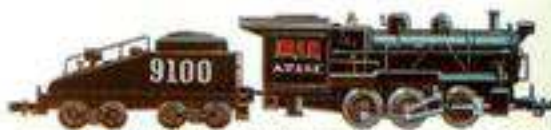
8-6-0 STEAM LOCOMOTIVE WITH TENDER, POWERED, 8 WHEEL DRIVE $25.00

Westinghouse 2912 2912 2912 Baltimore & Ohio 2912 2912 2912 Canadian National 2912 2912 2912 Canadian Pacific 2912 2912 2912 Penn Central 2912 2912 2912 Santa Fe 2912 2912 2912 Union Pacific 2912 2912 2912