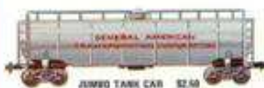
JUMBO TANK CAR $2.50

Washington 2128 Price 2128 Penn Central 2128 St. Clair 2128