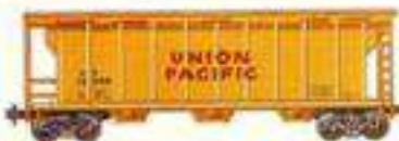
50' COVERED HOPPER $2.50

Holly Spur 2127 Rockon & Mann 2128 Northwestern Pacific 2128 Union Pacific 2128