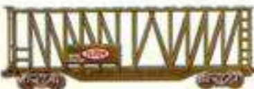
70 TON CONTAINER CAR $2.25

Holly Spur 2127 Rockon & Mann 2128 Northwestern Pacific 2128 Union Pacific 2128