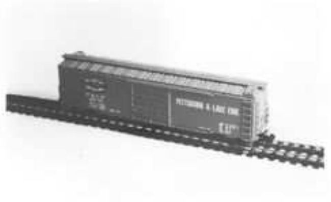
NYC 50' Modern Boxcar $2.75