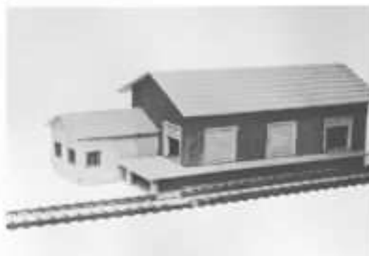
Freight Station B-641 Kit $1.98

This model was also produced using plans of a small freight station found in Wisconsin. It is ideal for that small siding or factory site. Wood grain simulated to reproduce the weathering. A real winner.