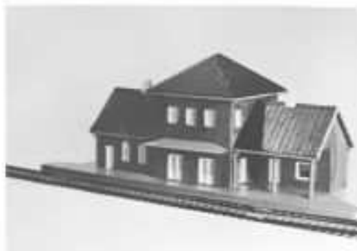
Passenger Station B-640 Kit $3.49

This passenger station kit was modeled after a Station found on the Pennsylvania System in the eastern United States. The model has moulded red brick walls, green trim, white windows and a black roof . . . WOW.