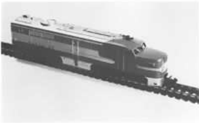
Santa Fe "PA-1" Diesel $14.98