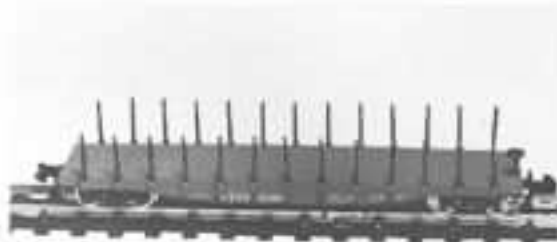
Santa Fe 50' Steel Flatcar $2.50