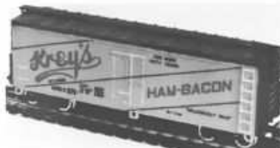
Krey's Wood Reefer $2.75