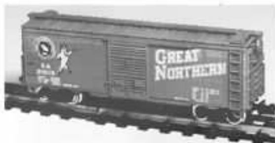
Standard Great Northern Boxcar $2.75