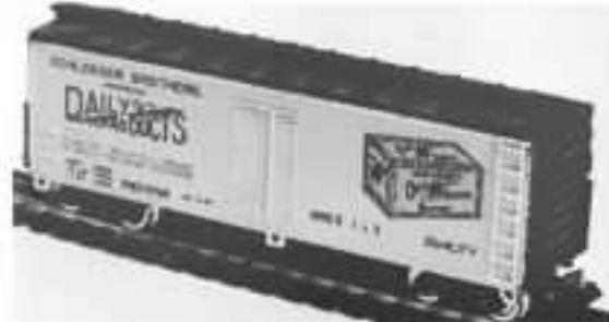
Schlosser's Dairy Car $2.75