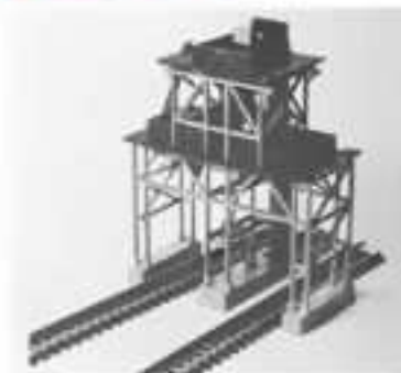
Coal Loading Silo B-662 Kit $1.98

The factory found this little Danish coaling silo just too nice to resist modelling. Can be used to load engines, or around mines to load coal cars. (Or how about a sand and gravel yard . . . or maybe a . . .)