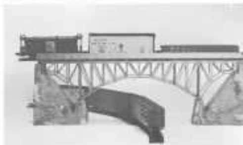
Arch Bridge with Fiers B-661 Kit $3.29

This bridge can be found in the book "Bridges and Buildings" by Kolmbach . . . some changes were made to mould in plastic, but all the detail is there, and of USA design, but you can find a use for several of these and to end.