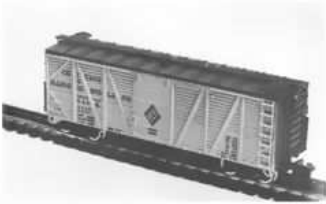
C&I.M. Outside braced boxcar $2.75