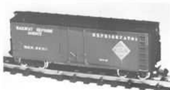
Railway Express Steel Reefer $2.75