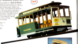
Powell & Hyde 21-0026-01