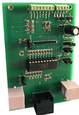
ITEM # 70 000 046 UNIVERSAL SIGNAL CONTROL BOARD