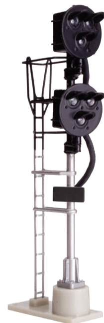
ITEM # 70 000 077 HO DOUBLE HEAD TYPE G SIGNAL