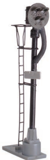
ITEM # 70 000 102 N SINGLE HEAD TYPE G SIGNAL

From basic layouts to large club empires, the All Scales Signal System opens the gateway to enhanced prototypical operation and realism and ensure that "You're on the Right Track...with Atlas!®"