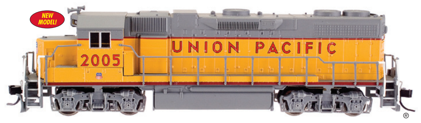
GP-38-2 Locomotive - UNION PACIFIC<sup>†</sup> #2005, 2017, 2020 • Standard Item #s 47622, 47623, 47624 • Decoder Item #s 47808, 47809