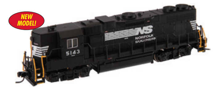
GP-38-2 High-Hood Locomotive - NORFOLK SOUTHERN #5105, #5139, #5143 • Standard Item #s 47760, 47761, 47762 Decoder Item #s 47880, 47881