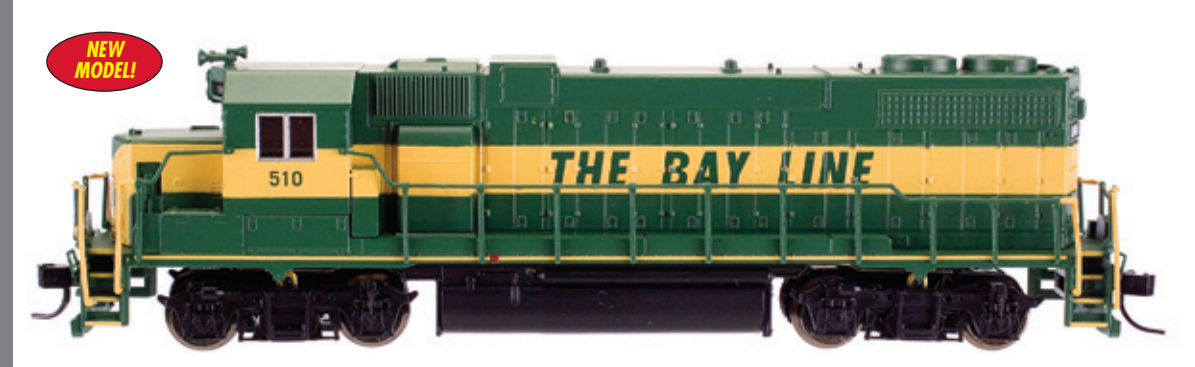
GP-38-2 Locomotive - ATLANTA & ST. ANDREWS BAY #508, 509, 510 • Standard Item #s 47610, 47611, 47612 • Decoder Item #s 47800, 47801