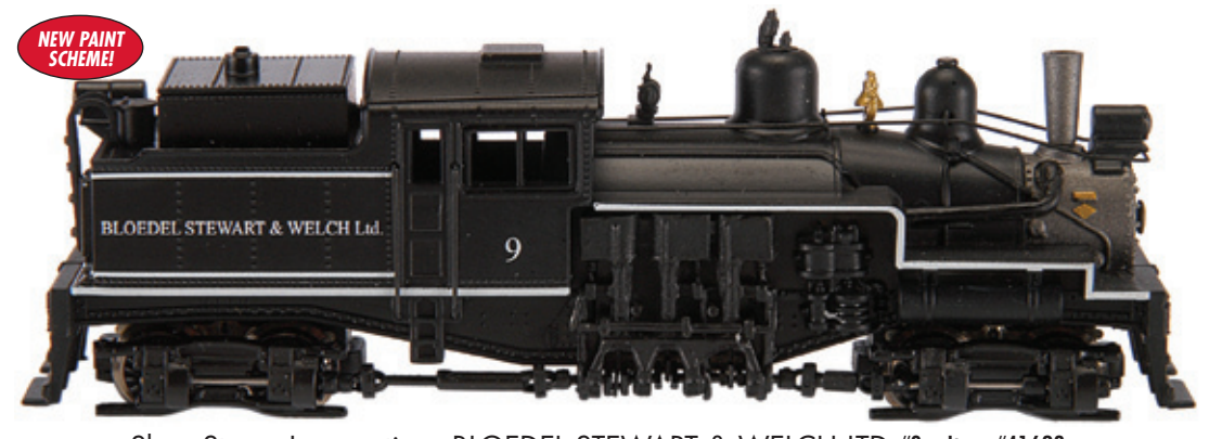
Shay Steam Locomotive - BLOEDEL STEWART & WELCH LTD #9 - Item #41628