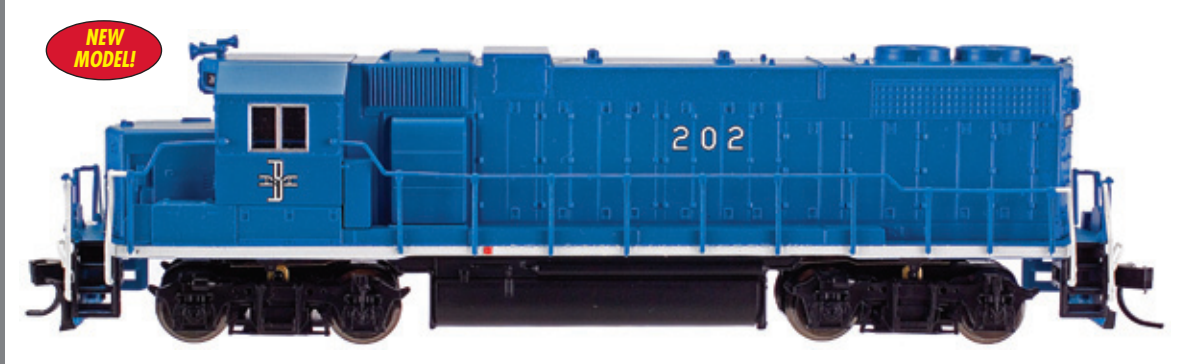
GP-38-2 Locomotive - BOSTON & MAINE #202, 205, 210 • Standard Item #s 47613, 47614, 47615 • Decoder Item #s 47802, 47803