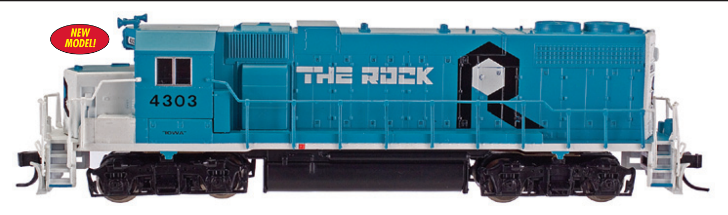
GP-38-2 Locomotive - ROCK ISLAND #4300, 4303, 4304 • Standard Item #s 47619, 47620, 47621 • Decoder Item #s 47806, 47807