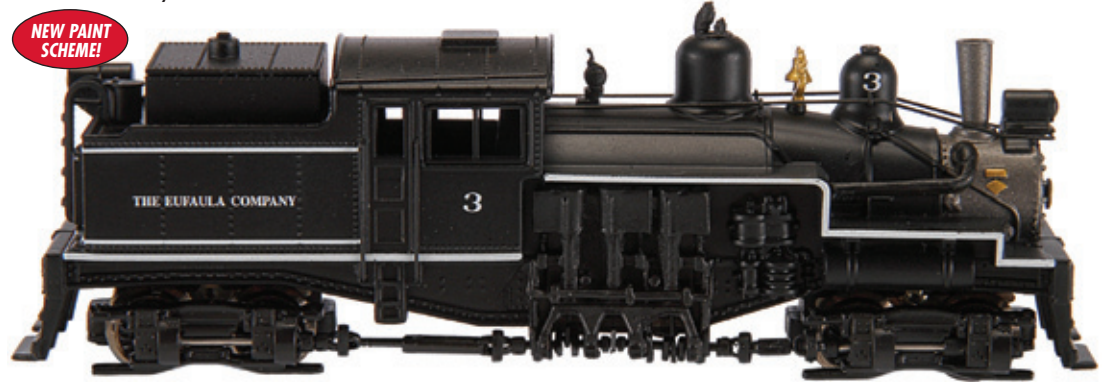
Shay Steam Locomotive - EUFAULA COMPANY #3 - Item #41629