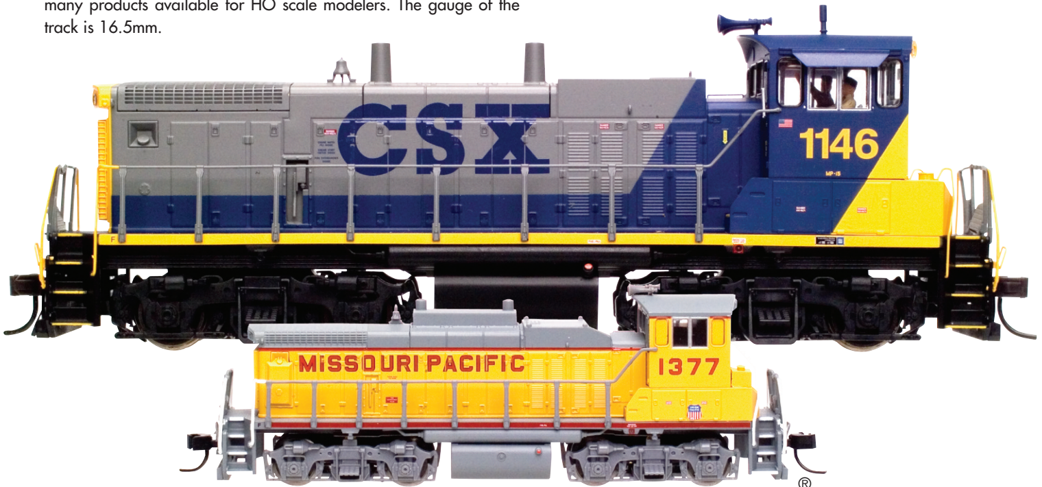
(HO and N scales MP15DC Locomotives)

PLEASE NOTE: For the purpose of this catalog, photos and/or illustrations on other pages may be shown larger or smaller than actual models.